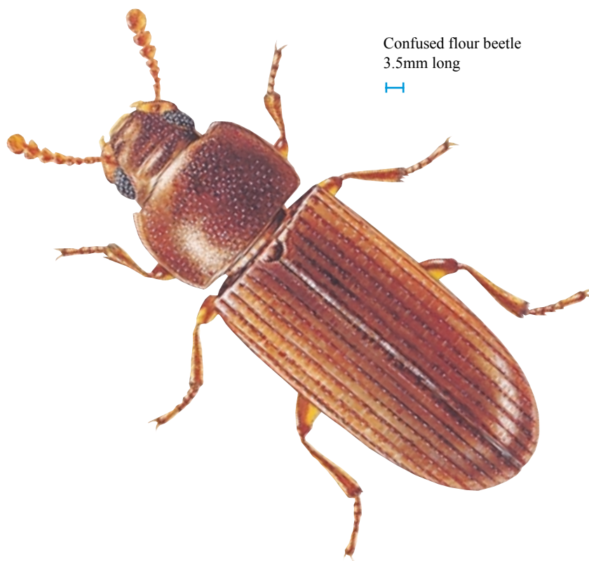
Confused flour beetle 3.5mm long

Adult elongate, 3-4mm long; male with conspicuously enlarged, toothless mandibles, slender and in-curved.